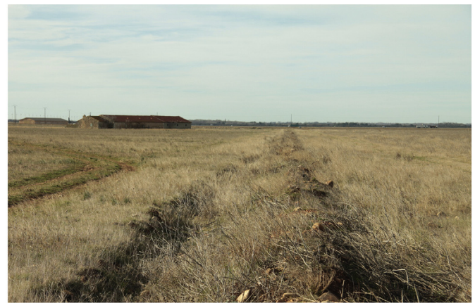
Fig. 2. Out-of-kind biodiversity offsetting in Crau (France). Diversity of pre-restoration habitats (top) is higher than the development that is left in perpetuity (middle) and compensated through restoration (bottom). True compensation would aim to renature an equivalent artificial area to that of developed, which likely requires much more time and effort than simply enhancing a degraded ecosystem. In this case, there is a net gain of steppe habitat through enhancement but a net loss overall (see Section 3).

metrics of inter and intraspecific genetic diversity (e.g. Faith et al., 2004) in offset equivalence calculations could help address this issue.